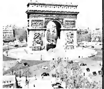
Arc de Triomphe, landmark of Paris